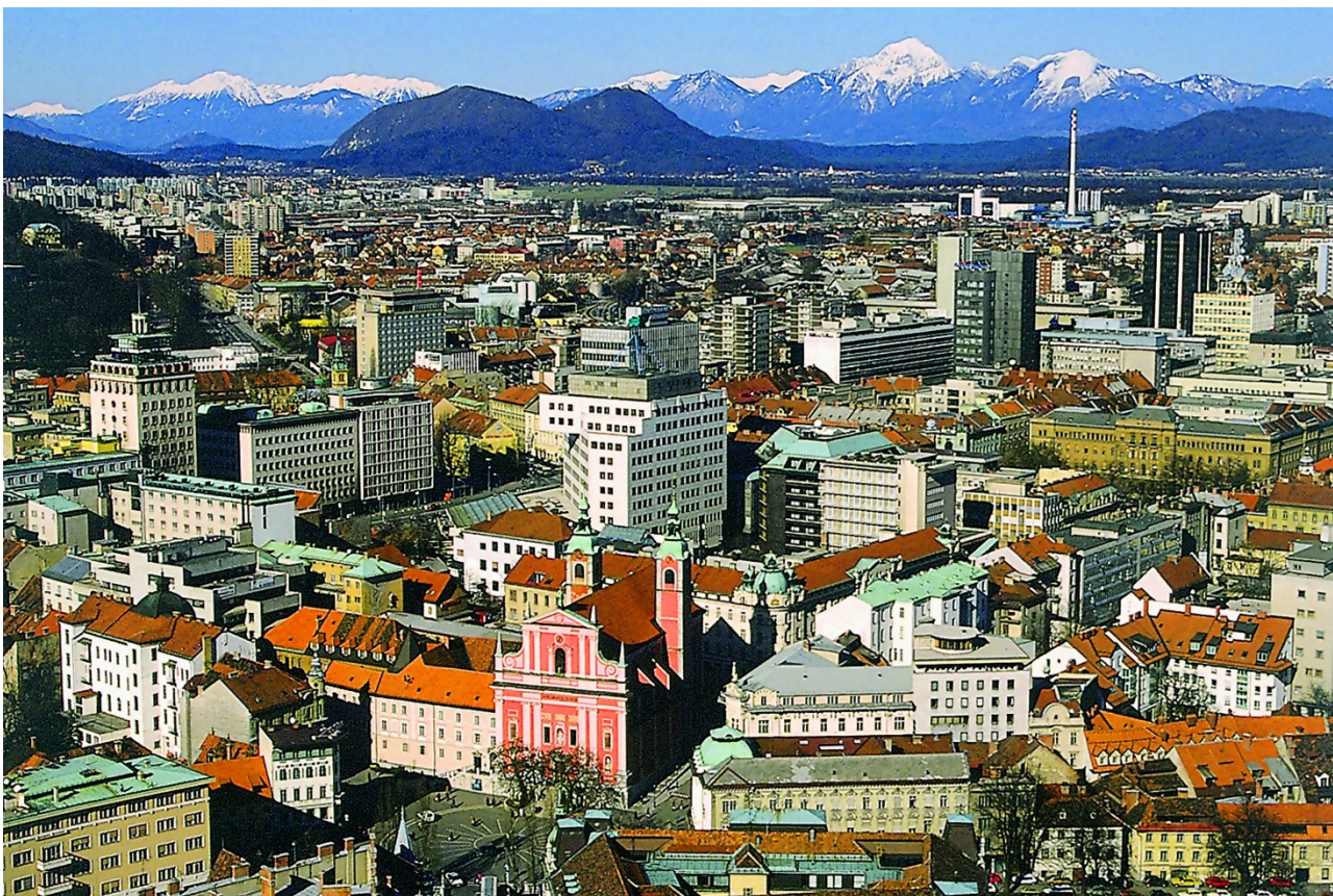
Ljubljana)